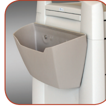
Bulk Storage Bins