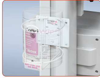
Sanitizing Wipes Bracket