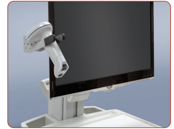
Forked Scanner Holder

Check with your Capsa Healthcare regional sales manager about these and more accessories specific to your chosen point-of-care solution.