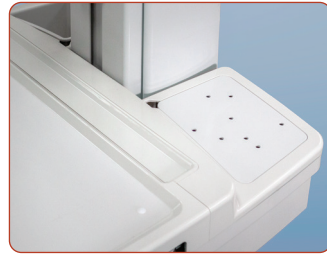
Pre-Drilled Rear Bin Scanner Plate