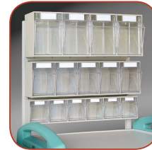
Tilt Bin Organizer