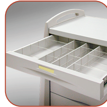
3" Drawer Dividers (8)