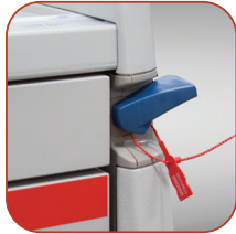
Tamper Evident Seals (100)

Add the following convenient accessory package to your cart to enhance workflow efficiency and support critical care response.