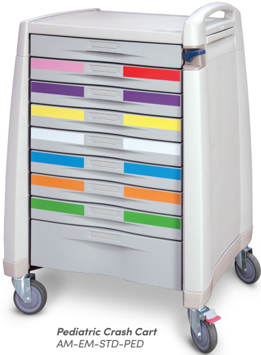
Pediatric Crash Cart AM-EM-STD-PED

The Avalo Series Pediatric Crash Cart is designed for use with the proven clinical methodology for treating life-threatening emergencies in pediatric patients. When seconds matter, the color coded drawers enable clinicians to quickly identify critical supplies when responding to emergencies.