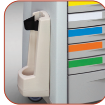
Oxygen Tank Holder