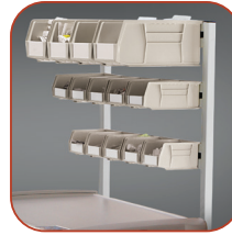
Bulk Storage Bins