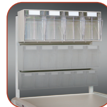
Tilt Bin Organizer