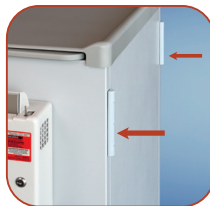
Chair Rail Bumpers