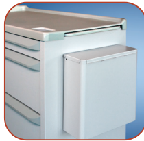
Waste w/ Lid