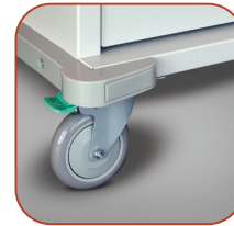
5" Tracking Wheel