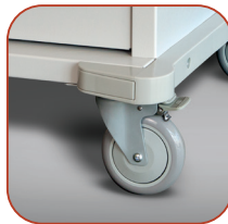
5" Braking Wheel