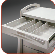
Supply Drawer Divider Kit