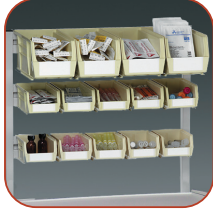
Bulk Storage Bins