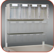
Tilt Bin Organizer