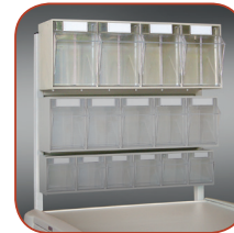
Tilt Bin Organizer