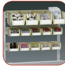
Bulk Storage Bins