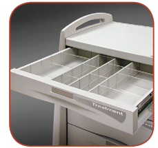
Supply Drawer Divider Kit