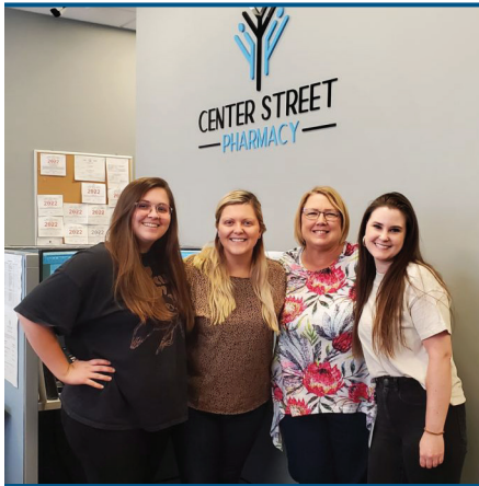
The Center Street Pharmacy successfully navigated a major technology transition to NexsysADC™

NexsysADC™ automated dispensing technology successfully replaced older, inefficient medication management cabinets at 10 North Carolina long-term care facilities, despite numerous challenges during the COVID-19 pandemic.