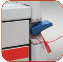
Tamper Evident Seals (100)

Add the following convenient accessory package to your cart to enhance workflow efficiency and support critical care response.