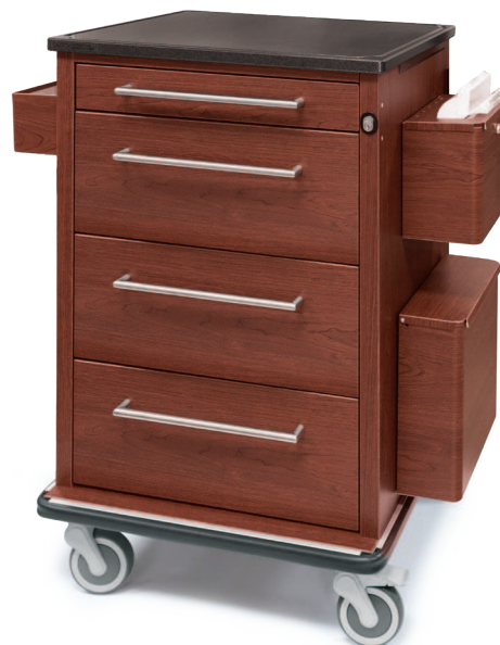
VE3-PC punch card cart shown with optional accessories in Boston Cherry