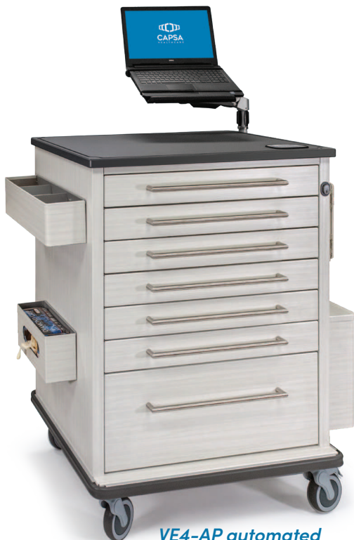
VE4-AP automated packaging cart shown with optional accessories in White Ash