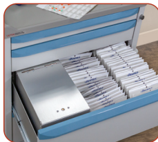
Locked Narcotic Storage