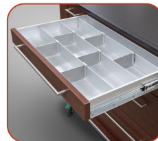
Externals Drawer Dividers